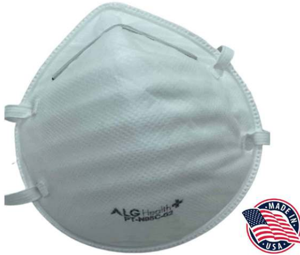
Made in the USA with globally sourced materials!